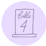
table numbers, sign holders